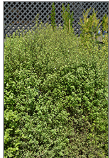
Oliver Twist Kohuhu