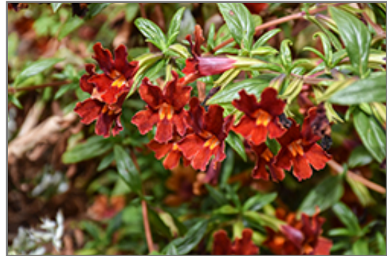
Jelly Bean Red Monkeyflower flowers

Jelly Bean Red Monkeyflower is recommended for the following landscape applications;