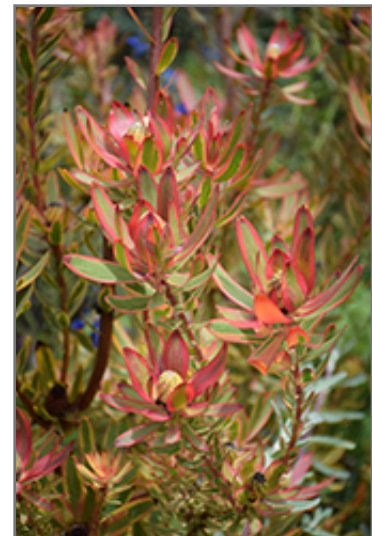
Jester Conebush flowers