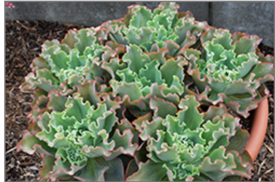
Giant Blue Echeveria