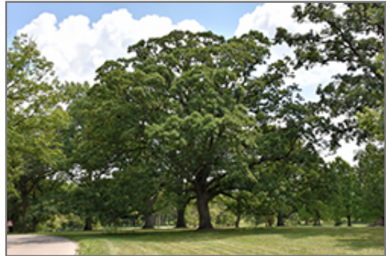
White Oak