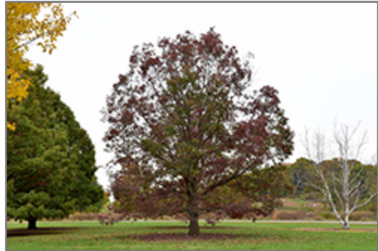
White Oak in fall

This tree should only be grown in full sunlight. It is very adaptable to both dry and moist locations, and should do just fine under average home landscape conditions. It is not particular as to soil type, but has a definite preference for acidic soils. It is highly tolerant of urban pollution and will even thrive in inner city environments. This species is native to parts of North America.