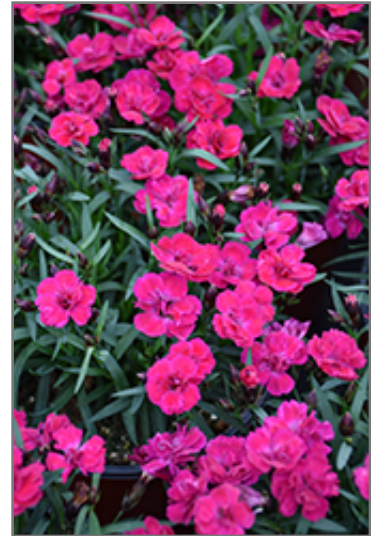
Beauties Tiiu Pinks flowers

Beauties Tiiu Pinks is recommended for the following landscape applications;