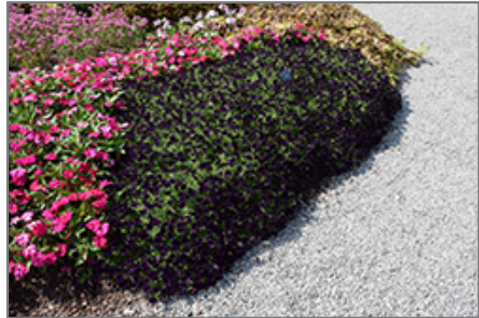
Supertunia Mini Vista Midnight Petunia in bloom

Supertunia Mini Vista Midnight Petunia is a fine choice for the garden, but it is also a good selection for planting in outdoor containers and hanging baskets. Because of its trailing habit of growth, it is ideally suited for use as a 'spiller' in the 'spiller-thriller-filler' container combination; plant it near the edges where it can spill gracefully over the pot. Note that when growing plants in outdoor containers and baskets, they may require more frequent waterings than they would in the yard or garden.