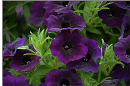
Supertunia Mini Vista Midnight Petunia flowers

This plant will require occasional maintenance and upkeep. Trim off the flower heads after they fade and die to encourage more blooms late into the season. It is a good choice for attracting butterflies and hummingbirds to your yard, but is not particularly attractive to deer who tend to leave it alone in favor of tastier treats. It has no significant negative characteristics.