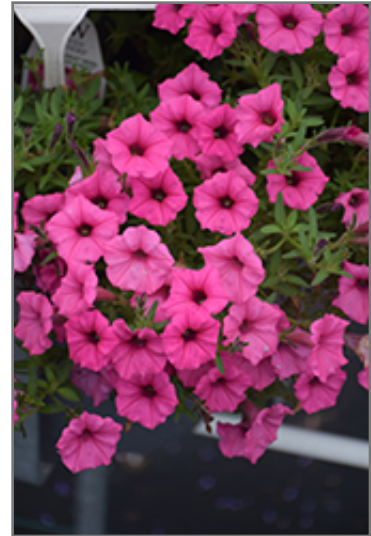
Supertunia Mini Vista Hot Pink Petunia flowers

Supertunia Mini Vista Hot Pink Petunia is recommended for the following landscape applications;