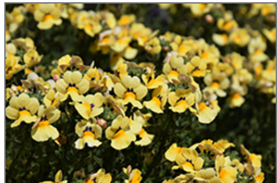
Nesia Inca Nemesia flowers