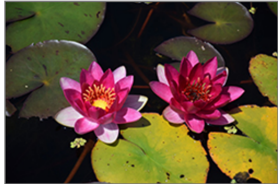
Laydekeri Fulgens Hardy Water Lily flowers

Laydekeri Fulgens Hardy Water Lily is ideally suited for growing in a pond, water garden or patio water container, and is recommended for the following landscape applications;