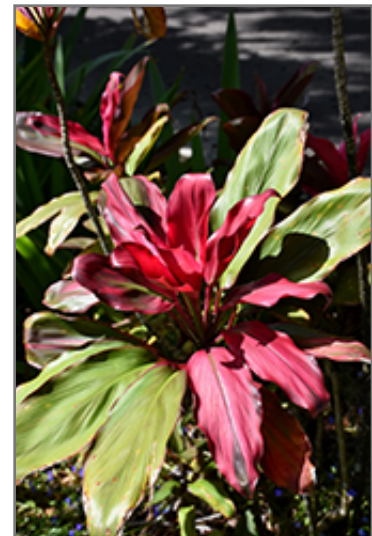
Sunset Hawaiian Ti Plant