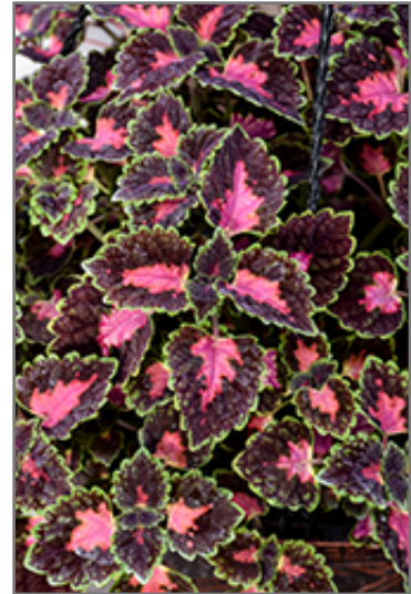
TrailBlazer Road Trip Coleus foliage

TrailBlazer Road Trip Coleus is recommended for the following landscape applications;