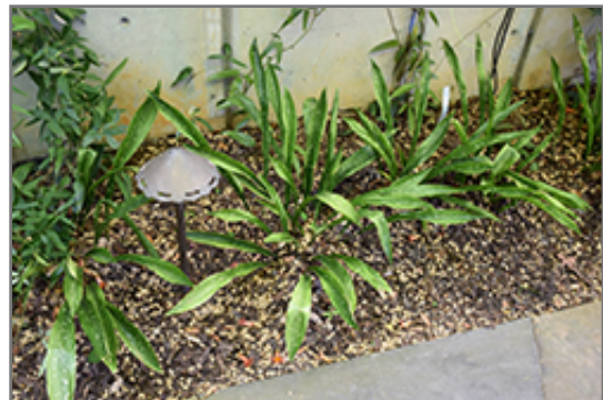
Nagoya Stars Cast Iron Plant