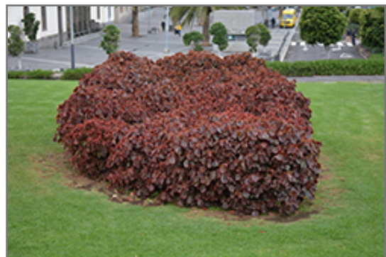
Obovata Copperleaf