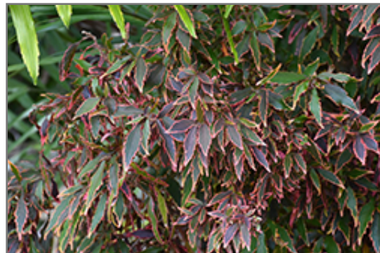
Firestorm Copperleaf foliage