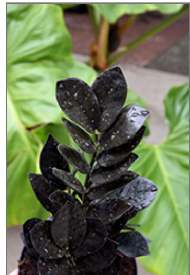
Raven ZZ Plant flowers