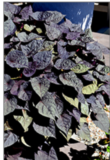
Spotlight Black Heart Sweet Potato Vine foliage