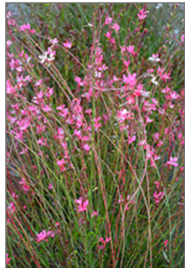
Ballerina Rose Gaura in bloom