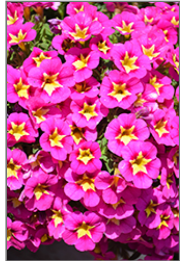
Bumble Bee Hot Pink Calibrachoa flowers

This plant will require occasional maintenance and upkeep. Trim off the flower heads after they fade and die to encourage more blooms late into the season. It is a good choice for attracting bees and hummingbirds to your yard, but is not particularly attractive to deer who tend to leave it alone in favor of tastier treats. It has no significant negative characteristics.