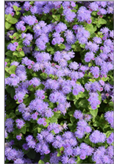
Aguilera Sky Blue Flossflower flowers

Aguilera Sky Blue Flossflower is recommended for the following landscape applications;