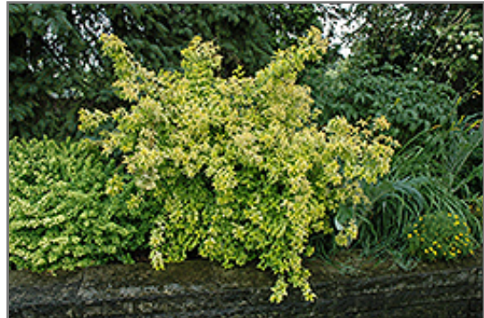
Gold Leaf Forsythia

Gold Leaf Forsythia is recommended for the following landscape applications;