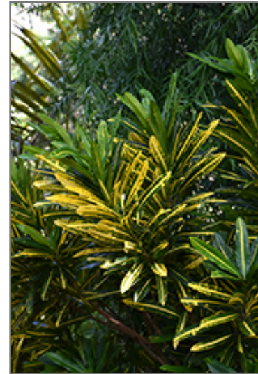
Sunny Star Variegated Croton foliage