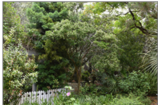
Simpson's Stopper in bloom