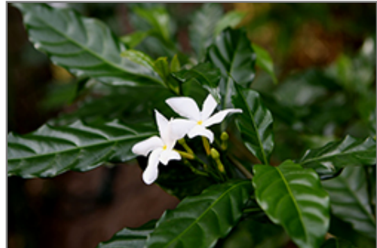
Crepe Jasmine flowers

This is a dense multi-stemmed evergreen houseplant with an upright spreading habit of growth. Its relatively coarse texture stands it apart from other indoor plants with finer foliage. This plant may benefit from an occasional pruning to look its best.