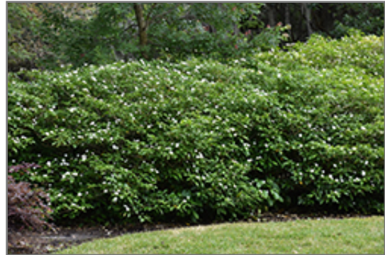
Crepe Jasmine in bloom

Crepe Jasmine is a dense multi-stemmed evergreen shrub with an upright spreading habit of growth. Its relatively coarse texture can be used to stand it apart from other landscape plants with finer foliage.