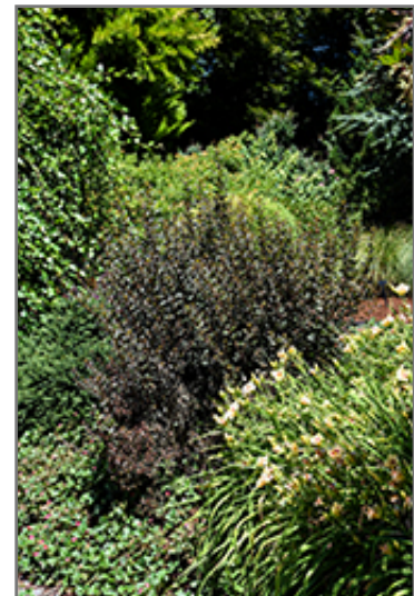
Little Joker Ninebark