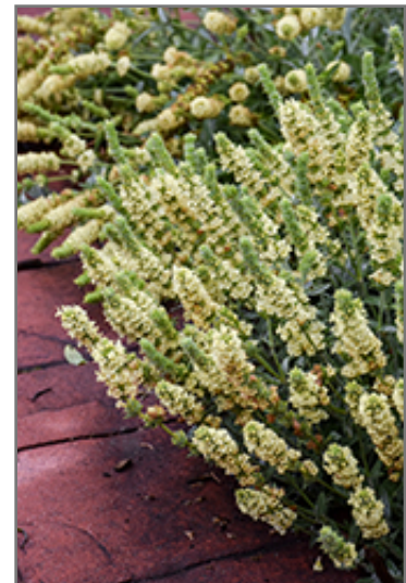
Ironwort flowers Photo courtesy of NetPS Plant Finder