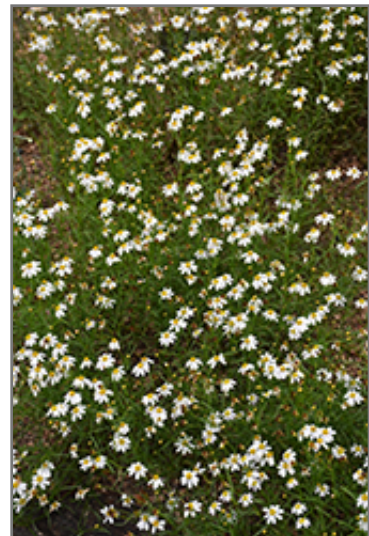
White Alpine Tickseed flowers