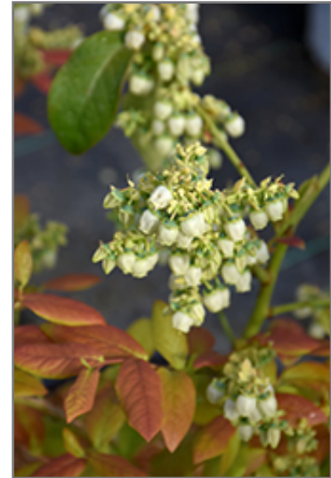
Sky Dew Gold Ornamental Blueberry flowers

Sky Dew Gold Ornamental Blueberry has attractive gold-variegated lime green foliage with hints of chartreuse which emerges brick red in spring on a plant with an upright spreading habit of growth. The glossy oval leaves are highly ornamental and turn outstanding shades of orange and scarlet in the fall. It features dainty clusters of white bell-shaped flowers hanging below the branches in mid spring. It features an abundance of magnificent blue berries in mid summer. The smooth brick red bark adds an interesting dimension to the landscape.