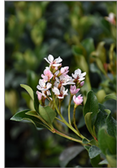
La Vida Mas Indian Hawthorn flowers

La Vida Mas Indian Hawthorn is recommended for the following landscape applications;