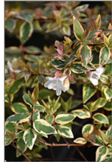
Tres Amigos Abelia flowers

Tres Amigos Abelia is recommended for the following landscape applications;