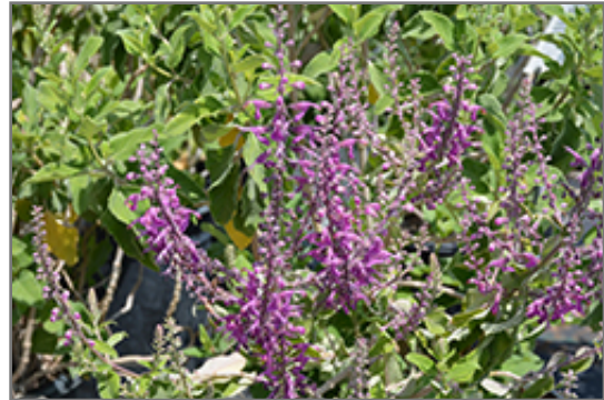
Madeira Germander flowers

This is a relatively low maintenance shrub, and should only be pruned after flowering to avoid removing any of the current season's flowers. It is a good choice for attracting bees and butterflies to your yard, but is not particularly attractive to deer who tend to leave it alone in favor of tastier treats. It has no significant negative characteristics.