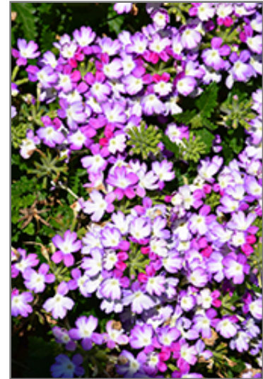
BeBop Lavender Verbena flowers

BeBop Lavender Verbena is recommended for the following landscape applications;