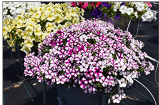
Shortcake Blueberry Petunia in bloom