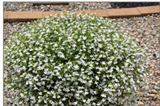
Suntory Trailing White Lobelia in bloom