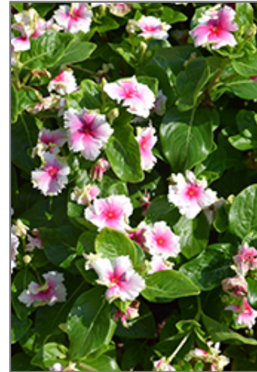
Soiree Flamenco Seniorita Pink Vinca in bloom

This plant will require occasional maintenance and upkeep, and should not require much pruning, except when necessary, such as to remove dieback. It is a good choice for attracting butterflies to your yard, but is not particularly attractive to deer who tend to leave it alone in favor of tastier treats. It has no significant negative characteristics.