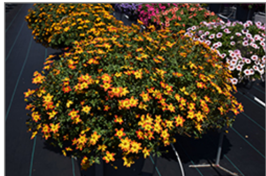
Blazing Glory Bidens in bloom