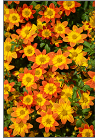
Blazing Glory Bidens flowers

Blazing Glory Bidens is recommended for the following landscape applications;