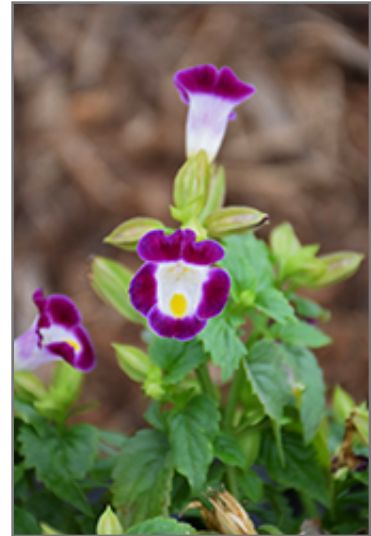
Kauai Burgundy Torenia flowers

Kauai Burgundy Torenia is recommended for the following landscape applications;