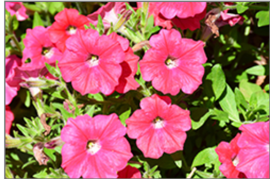
Opera Supreme Coral Petunia flowers

Opera Supreme Coral Petunia is recommended for the following landscape applications;