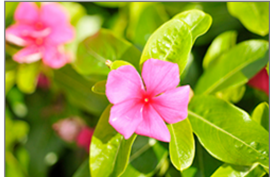
Pacifica XP Punch Vinca flowers

This plant will require occasional maintenance and upkeep, and should not require much pruning, except when necessary, such as to remove dieback. It is a good choice for attracting butterflies to your yard, but is not particularly attractive to deer who tend to leave it alone in favor of tastier treats. It has no significant negative characteristics.