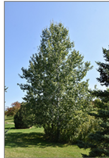
Trembling Aspen

Trembling Aspen is recommended for the following landscape applications;