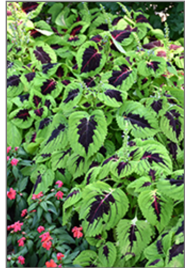
Kong Lime Sprite Coleus foliage

Kong Lime Sprite Coleus is recommended for the following landscape applications;