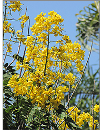
Whitebark Senna flowers

This tree will require occasional maintenance and upkeep, and should only be pruned after flowering to avoid removing any of the current season's flowers. It is a good choice for attracting birds and bees to your yard. Gardeners should be aware of the following characteristic(s) that may warrant special consideration;