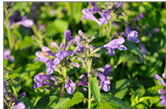
Prelude Purple Catmint flowers