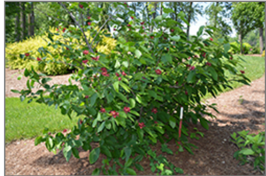
Simply Scentsational Sweetshrub in bloom

This shrub does best in full sun to partial shade. It is very adaptable to both dry and moist locations, and should do just fine under average home landscape conditions. It is not particular as to soil type or pH. It is somewhat tolerant of urban pollution. This is a selection of a native North American species.