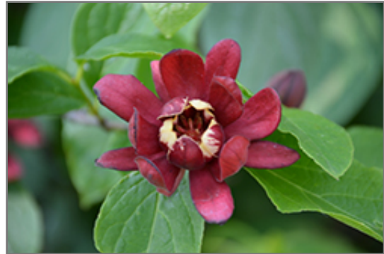
Simply Scentsational Sweetshrub flowers

Simply Scentsational Sweetshrub is recommended for the following landscape applications;