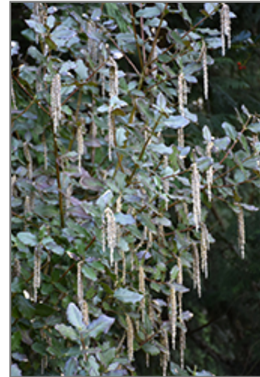
Siskiyou Jade Silk Tassel Bush flowers

Siskiyou Jade Silk Tassel Bush is recommended for the following landscape applications;