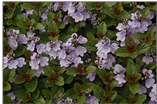
Waterperry Blue Speedwell flowers