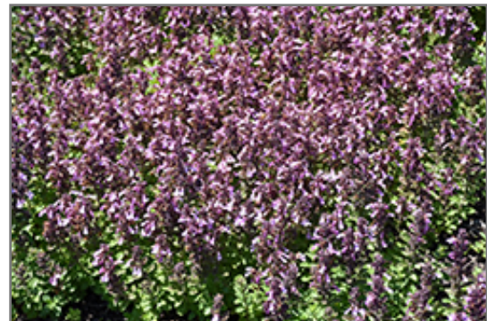
Pride Of Georgia Germander in bloom