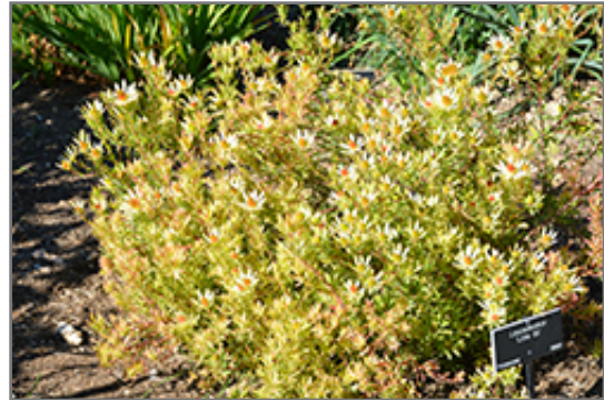
Little Bit Conebush

Little Bit Conebush makes a fine choice for the outdoor landscape, but it is also well-suited for use in outdoor pots and containers. With its upright habit of growth, it is best suited for use as a 'thriller' in the 'spiller-thriller-filler' container combination; plant it near the center of the pot, surrounded by smaller plants and those that spill over the edges. It is even sizeable enough that it can be grown alone in a suitable container. Note that when grown in a container, it may not perform exactly as indicated on the tag - this is to be expected. Also note that when growing plants in outdoor containers and baskets, they may require more frequent waterings than they would in the yard or garden.