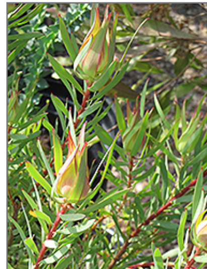
Little Bit Conebush