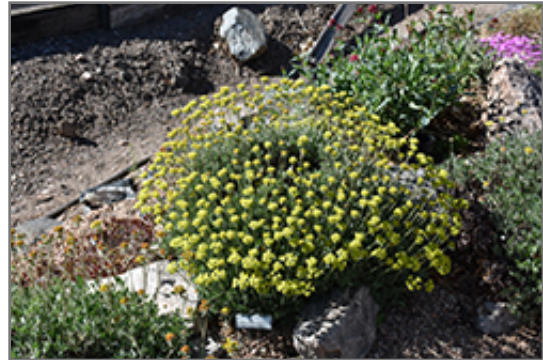
Kannah Creek Sulphur Flower Buckwheat in bloom

Kannah Creek Sulphur Flower Buckwheat is recommended for the following landscape applications;